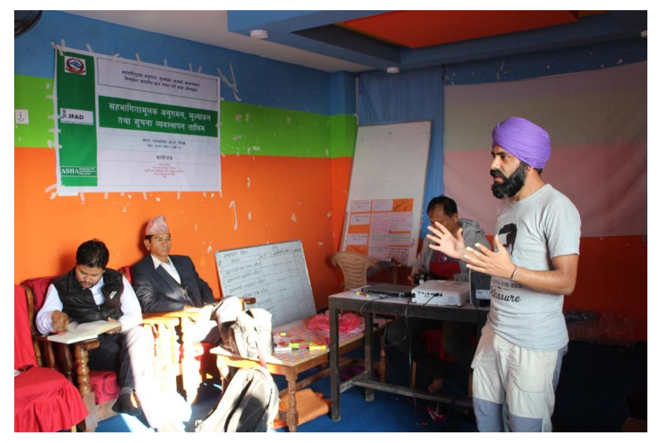
Photo 3: Training coordinator; DCCS putting his words regarding the training.