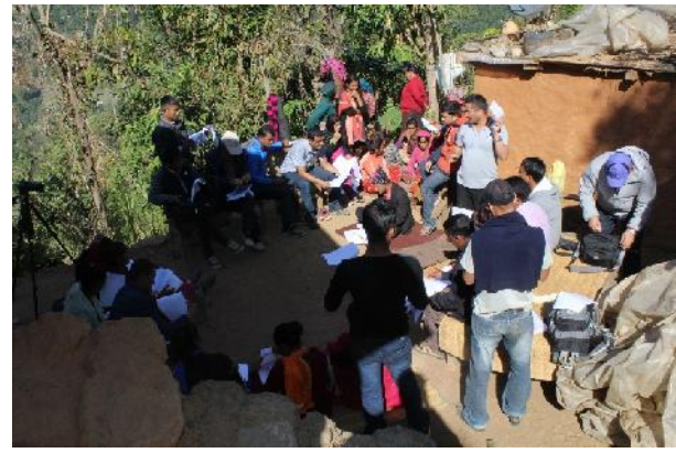
Photo 4: Discussion with community involved in LAPA preparation at Dungeshwor RM and participants