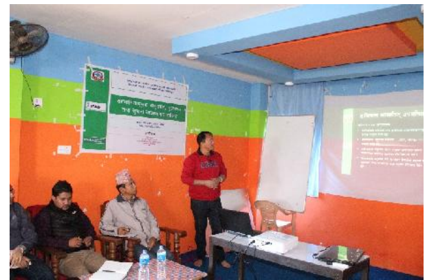
Photo 4: KM Specialist presenting on different KM and communication tools.